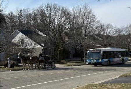
Horses still have to follow 30km speed limit on Ptarmigan Road