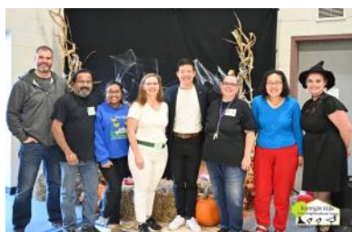
2024 KHNG executive committee & Ward 6 Councillors at Boonanza